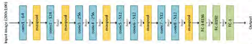
The convolutional neural network architecture used for soil roughness estimation.